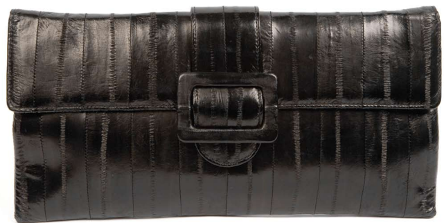
Electric Fantasy clutch Makki £115.00