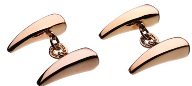
Rogue Tusk 18ct Rose Gold Cufflinks Links of London £950.00