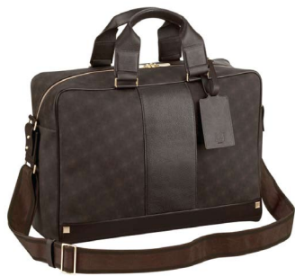
Dunhill d-eight Brown Holdall £365.00