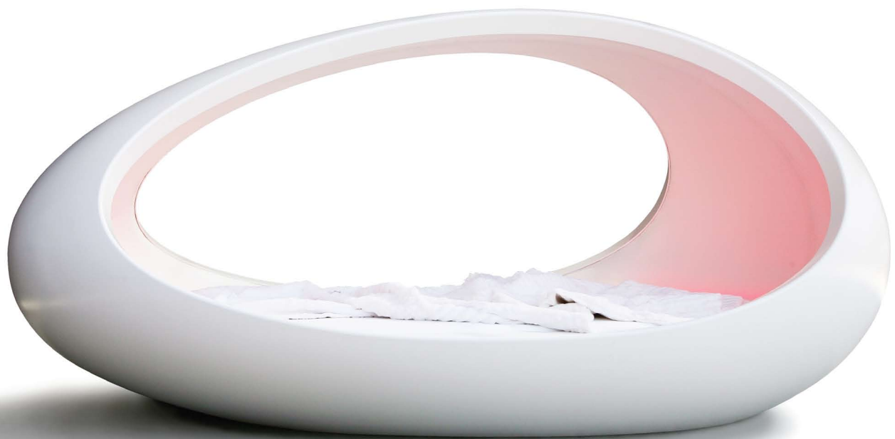
Lomme bed €42,000.00