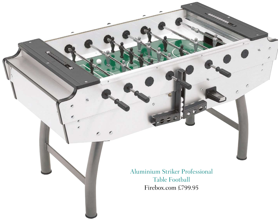
Aluminium Striker Professional Table Football Firebox.com £799.95