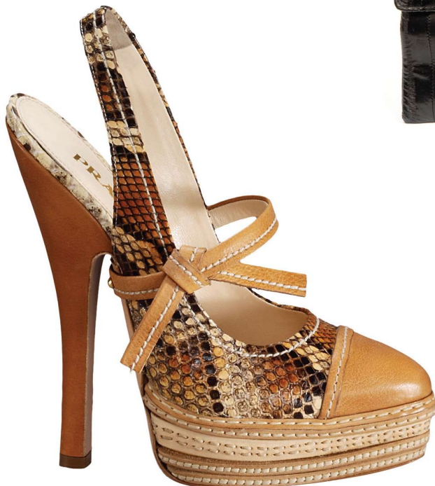
Prada Mary-Jane Platforms Selfridges, £390.00