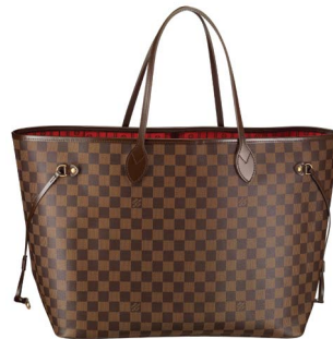
Louis Vuitton Neverfull Daimier Bag Selfridges, from £380.00