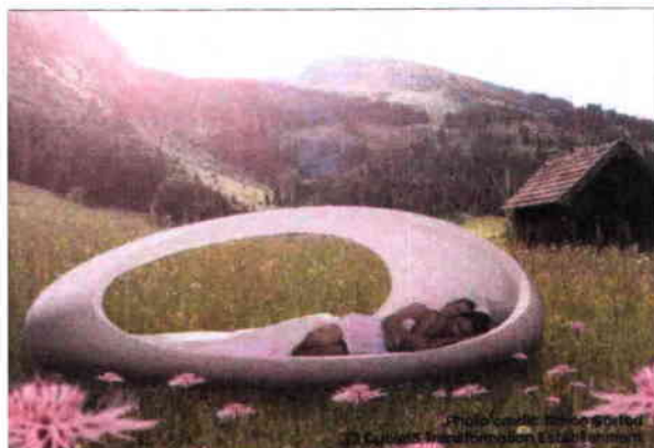
Below: Your £40,000 comfort bubble?